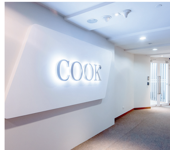
▲ A look inside Cook Singapore's new office space. The top picture shows the seven-person meeting room and the bottom image is of the entryway.